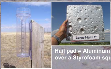
Hail pad = Aluminum foil over a Styrofoam square

The CoCoRaHS Network is a non-profit community-based group of volunteers who collect data on rain, hail and snow using simple low-cost rain gauges and hail pads.