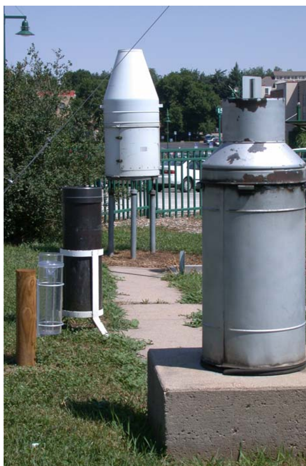
Figure 1. Example rain gauges at the Fort Collins, Colorado, National Weather Service Historical Climate Network weather station 05-3005-4.