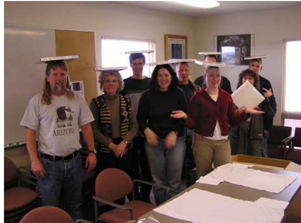
Figure 6. Volunteers at a Hail Pad Making Party

We have recently begun to routinely involve large numbers of volunteers in manufacturing hail pads. Once each month we gather during the lunch hour in Fort Collins and enjoy food and social times while folding, wrapping and stacking hundreds of new hail pads for the coming year.