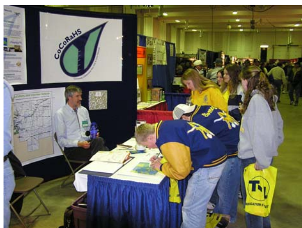
Figure 8. Students learning about CoCoRaHS at the 2005 Colorado Farm Show

When schedules allow, CoCoRaHS staff participate in conferences, educational fairs and festivals and even museum exhibits. We were a part of the Jane Goodall “Make a Difference” exhibit at the Denver Museum of Nature and Science. We attend several children’s water festivals each year and also attend Farm Shows, fairs, the Colorado Science Convention, Conservation District Annual Meetings and other similar outreach events. These events also become convenient opportunities to recruit new volunteers to join CoCoRaHS.