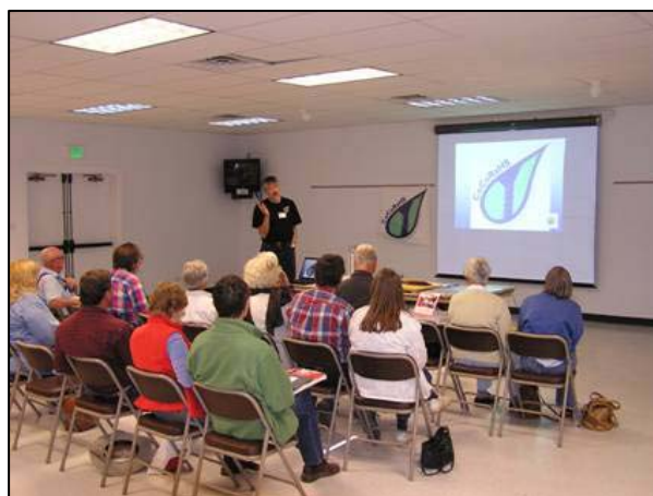
Figure 4. Volunteers attending a CoCoRaHS training session in Cortez, CO.

Volunteers are strongly encouraged to attend group training sessions lead by CoCoRaHS staff or trained trainers. It is also acceptable to read the on-line training materials or view the on-line or CD digital annotated slide show. We are working to implement a simple certification process that will assure that all volunteers entering data on the website have learned the basic elements of observation.