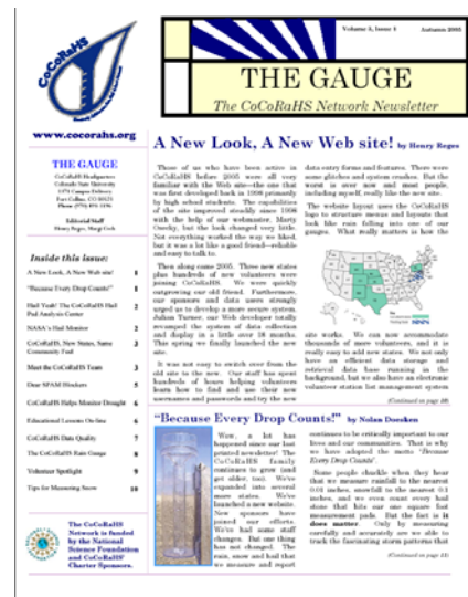
Figure 5. "The Gauge" CoCoRaHS's printed newsletter.

All participants with e-mail addresses and who are interested in our activities receive bi-weekly project updates and weather reports. This listserve was initially set up as a simple means of project communication, but it quickly became the primary method for continuing education. These updates are used to review and reinforce proper observation techniques, to communicate seasonal reminders and to answer frequently asked questions. E-mail updates are used to summarize recent interesting weather events and share information about weather forecasting, agricultural production, water supplies and other weather impacts and CoCoRaHS applications. These e-mail updates are the heart and soul of CoCoRaHS informal education and help maintain the project's sense of "community".