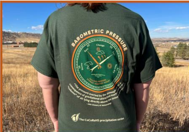
SHORT SLEEVE - $60 AND ABOVE DONATION

“YEAR-END” FUNDRAISER NOW THRU JAN 9, 2022