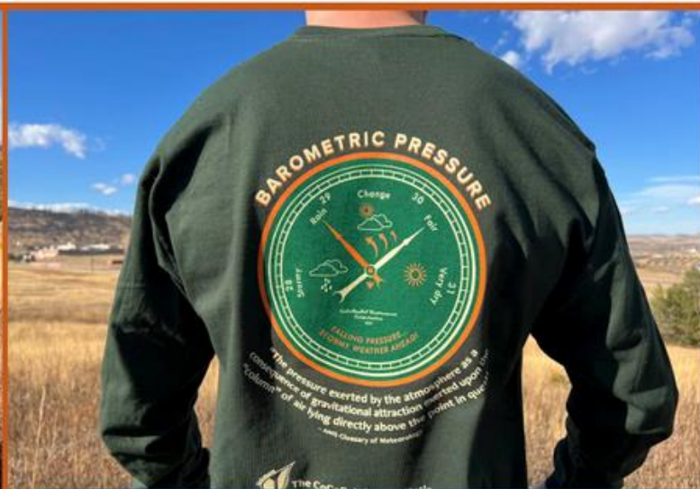
LONG SLEEVE - $100 AND ABOVE DONATION

"Thanks for the transparent and pleasant way you encourage donations! A welcome respite from the heavy-handed methods of some other organizations" - Donor